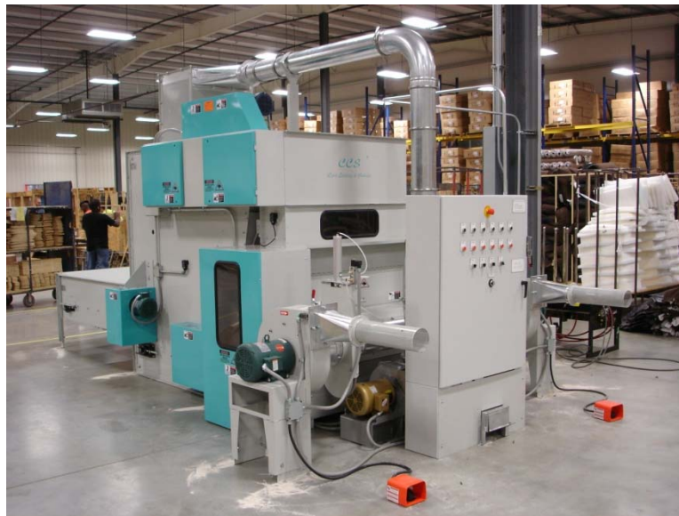
Optional recycle system shown

The ProLoft 1000 is our most popular Pillow and Cushion filling system. This system is capable of providing fully open fiber at the rate of approximately 600 to 1000 pounds per hour. The system consists of a vertical high speed opener, fiber stuffing fans and electrical control. This system includes a reserve feed hopper that allows the operator to insert a large amount of raw material into the feed hopper thus reducing the labor requirement. Once the feed hopper is full of raw material, the operator slides a tick on the stuffing nozzle and steps on the foot switch. The timer on the electrical control panel will establish the amount of fiber being inserted in the tick.